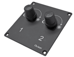
External OSD, 2 ports XAVL98502