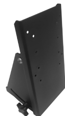
Multi attachment XAVL98201